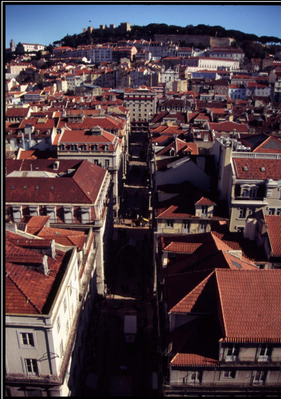
👁️ On your way to your destination, look to the right and left of the roadside. 😊 View from the Santa Justa elevator to the Saint George castle (Lisbon – Portugal) – December 2005